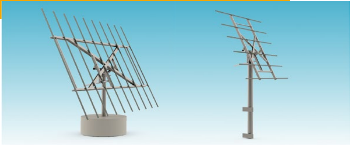
For open land